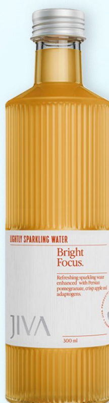
BRIGHT FOCUS 300ml

Daily Greens Enhanced Sparkling Water brings together refreshing, sparkling water with fresh green apple, a twist of lemon and a nutrient-packed, supergreens mix