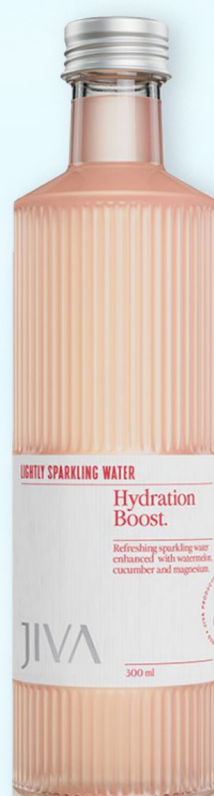
HYDRATION BOOST 300ml

Bright Focus Enhanced Sparkling Water brings together crisp sparkling water with rich fresh apple, pomegranate, Schisandra & Golden Oak Mushroom plant extracts.