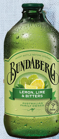
Lemon, Lime & Bitters