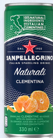
CLEMENTINA Clementine Orange