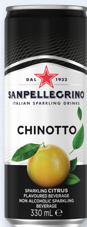
CHINOTTO Chinotto Orange