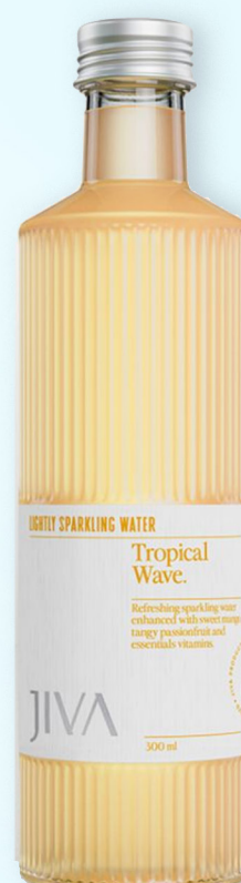
TROPICAL WAVE 300ml

Hydration Boost Enhanced Sparkling Water brings together thirst-quenching, crisp sparkling water with fresh watermelon, cucumber and replenishing electrolytes.