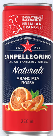
ARANCIATA ROSSA Blood Orange