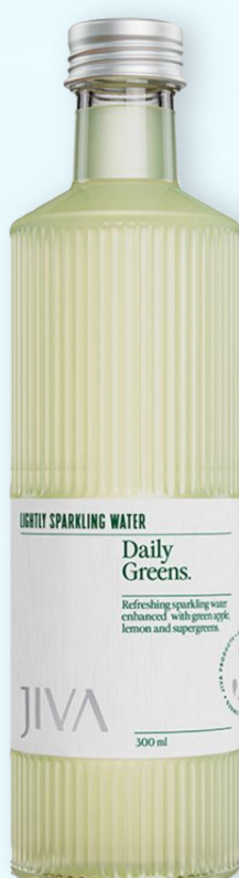
DAILY GREENS 300ml

All the essentials needed to help the body and mind cope with stress, reduce fatigue and promote mental wellbeing.