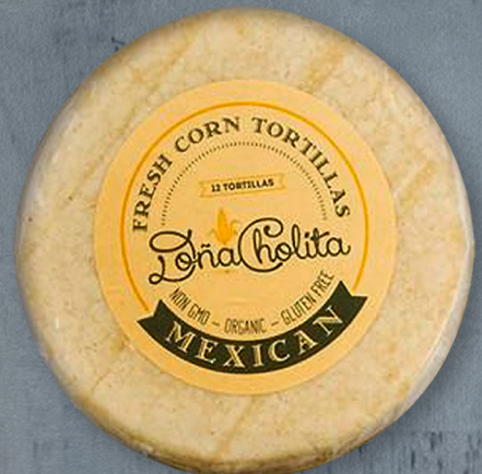
ORGANIC WHITE CORN TORTILLAS