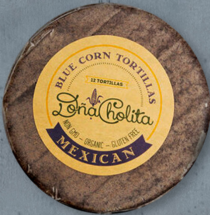
ORGANIC BLUE CORN TORTILLAS

Dona Cholita make their fresh corn tortillas and funky blue corn tortillas with organic, non GMO, nixamaised maize flour and filtered water. Nothing added, no preservatives or anything artificial. They are naturally gluten free and a great alternative to bread. The nixamaised maize flour (activated with lime) makes them easier to digest. Made with organic nixtamalized corn maize flour & filtered water. That's it!